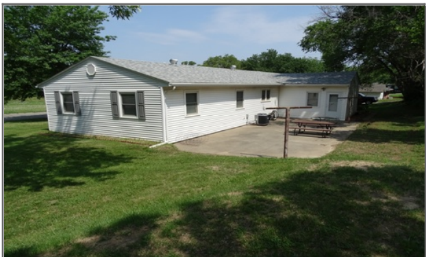
Back with patio